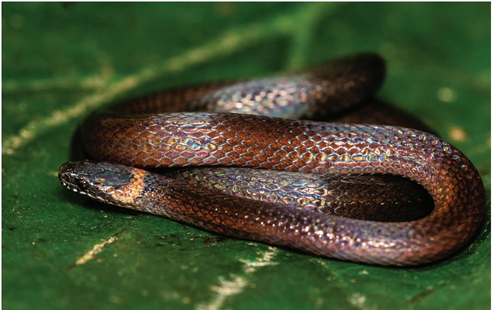
Figure 4. Individual of Rhadinella schistosa . Rediscovered in the community of Santa Cruz Tepetotula.

This micro endemic snake is only known from eight specimens collected 0.6 km south of Campamento Vista Hermosa, 1865 m a.s.l. (Bogert and Duellman 1963; Campbell et al. 1989). We recorded this species (17.73703°N, -96.5647°W, datum