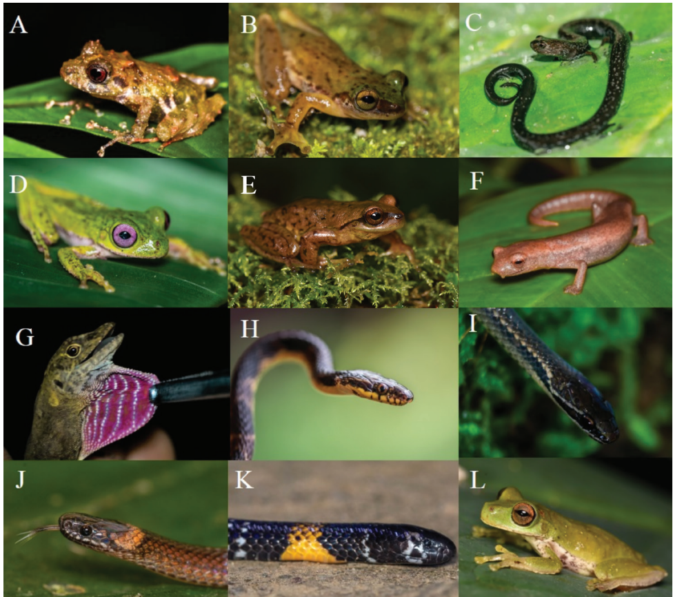
Figure 3. Amphibians and reptiles from Santa Cruz Tepetotutla: A Craugastor polymniae B Exerodonta abdivita C Pseudoeurycea orchileucos D Quilticobyla acrochorda E Sarcophyla celata F Bolitoglossa chinanteca G Anolis rubiginosus H Cryophis hallbergii I Rhadinaea bogertorum J Geophis laticinctus albiventris K Micrurus elegans and L Duellmanohyla ignicolor.

abundant. We found seven individuals perching on the leaves of ferns adjacent to streams both in primary montane cloud forest and in disturbed areas surrounded by coffee and banana plantations.