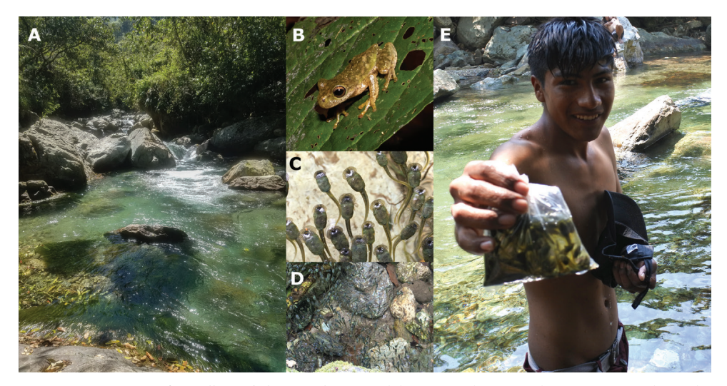
Figure 2. Aspects of Duellmanohyla ignicolor natural history and use A characteristic pools in the Tlacuache river where tadpoles aggregate B D. ignicolor adult C D. ignicolor tadpoles D school forming behavior E a teenager collecting tadpoles with a cap and keeping them in a plastic bag.

no agreement on when and by whom caldo de piedra was invented. Its ancient origin is claimed by some inhabitants of San Felipe Usila as a "millenary cooking practice uniquely developed by fishermen in his community" (Brulotte and Starkman 2014). The dish is based on a gendered division of labor where "women bathe and wash clothes in the river, but it's only adult men who fish and prepare the caldo. With the finished soup finally being offered to women and children" (Brulotte and Starkman 2014). Nevertheless, similar dishes are present in other Oaxacan cultures like Ayuk (Mixe) where it is named "caldo de playa" since it is made at the riverbanks (Nahmad 2003; Sánz 2015). There is evidence that this type of hot-rock cooking has been long used in by North American cultures (Thoms 2008), with the same cooking principle know to occur in Europe since the late Aurignacian (ca. 32,000–33,000 B.P.) and similar cooking technology occurring elsewhere in the world (Thoms 2009).